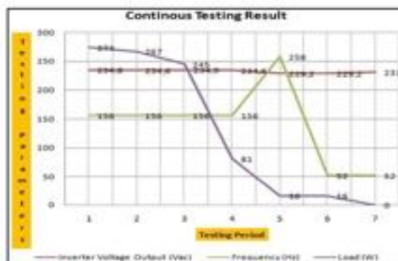
Figure 6: Frequency and voltage changing on continuous loads.

The SEPG supplies a continuous load for five hours. The output voltage level of the battery bank and inverter is located in safety regulation range. On this test indicates the frequency change from 52 Hz to 156 Hz which the frequency increases into three time. The power quality and characteristics of the power system is shown in Figure 6.