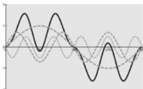
Figure 2: Current harmonic distortion.