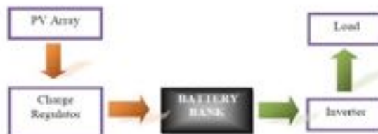
Figure 4: Scheme of the Battery charge and load system.

Load testing is conducted to measure the ability of solar modules to charge the battery bank that serves as energy storage. The diagram of solar modules test is shown in Figure 4.