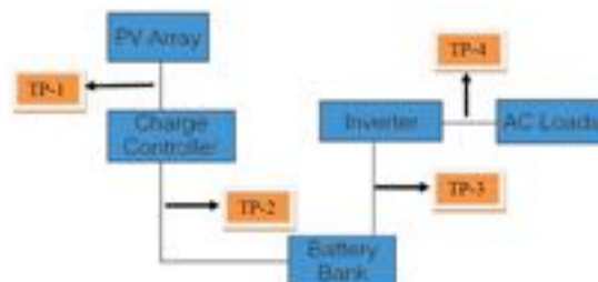
Figure 3: SEPG power quality of testing points.

SEPG was observed at the inverter output. The connected load was arranged by variation and continuous type in a certain time. Then, characteristics voltage and frequency of SEPG system will be analyzed.